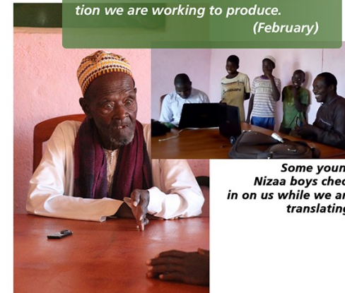
A Nizaa Elder giving counsel

Please pray for our translation progress, especially the work of testing our drafts with other Nizaa speakers and meeting with a consultant; that God will use these steps to further refine the translation we are working to produce. (February)